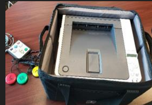
4. Remove Printer & Accessories Bag