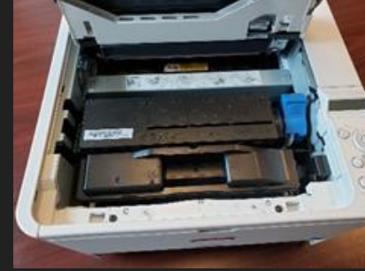
2. Confirm toner cartridge is inserted and blue lever is pushed back, locked in place