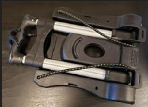
3. Fold down hand truck, wrap and attach bungies