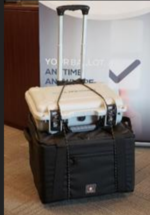
1. Unhook bungee cords from hand truck