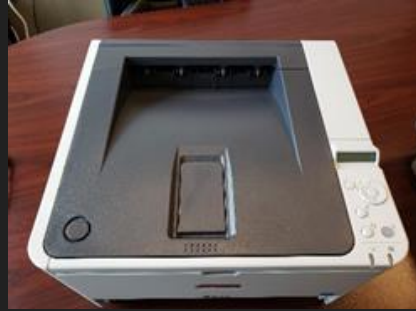
1. Open lid – push button on left

The Auditor-Treasurer's office has installed a new Okidata B432dn printer cartridge.