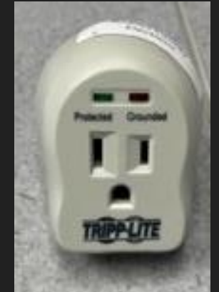
6. Please use surge protector located in mesh bag.