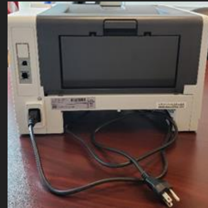
5. Plug in power cord (orange dot) and turn Power ON (bottom right hand side)