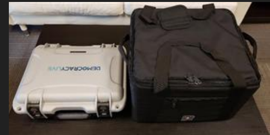
2. Separate Tablet from Printer case