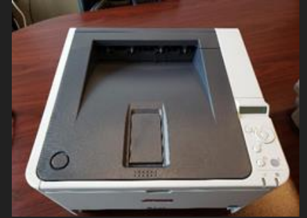
3. Push lid down to Close