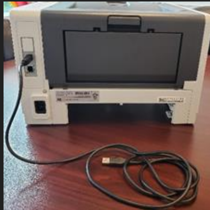
4. Plug in USB Printer Cable (purple dot)